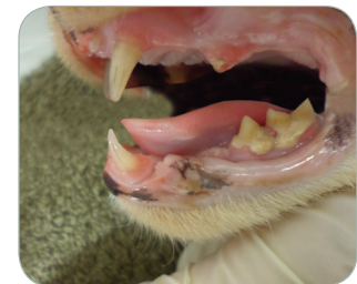
Red marks on the gums are a sign of gum disease

FORLs (resorptive lesions) -These are very painful small holes that appear in the teeth of some cats. It is not clear why they occur but teeth will always need attention if they are present.